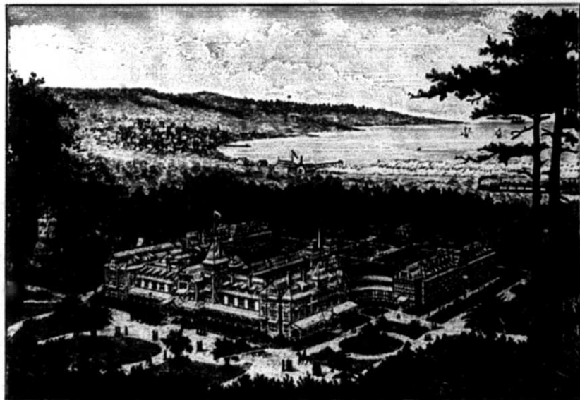
THE HOTEL DEL MONTE.

superb resort is visited principally by Californians, and visitors from the Southern States and Mexico, who wish to escape their hot summers; but in winter it is filled with visitors who come to escape the fearful weather of the Eastern States and bask in the splendid sunshine of Monterey. It might be inferred from this incomplete description that the charges at the Hotel del Monte are proportioned to the magnificence of the entertainment provided. Such, however, is not the case. On the contrary, so much higher are the charges at the fashionable watering places of the Southern States that one may visit the Hotel del Monte from the East and save money despite the far greater distance traveled.