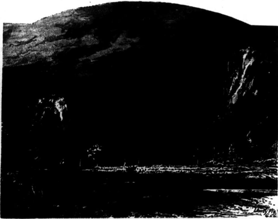
THE YOSEMITE VALLEY.

Of course the crowning glory of California's natural attractions is the Yosemite Valley; and no real visit to the State can be made without seeing this marvelous creation. As no other natural wonder in the world has been so often and ably described as this, we shall do hardly more than mention it. To reach it, we cross the bay from San Francisco to Oakland, and there take the Southern Pacific Company's train by way of Martinez and Lathrop. Here we enter the great San Joaquin Valley, the southern end of the vast interior basin, of which the Sacramento Valley is the northern end. On the right, toward the west, lies the Coast Range, low and dark, and on the east, the towering Sierra Nevadas, whose giant peaks are forever covered with