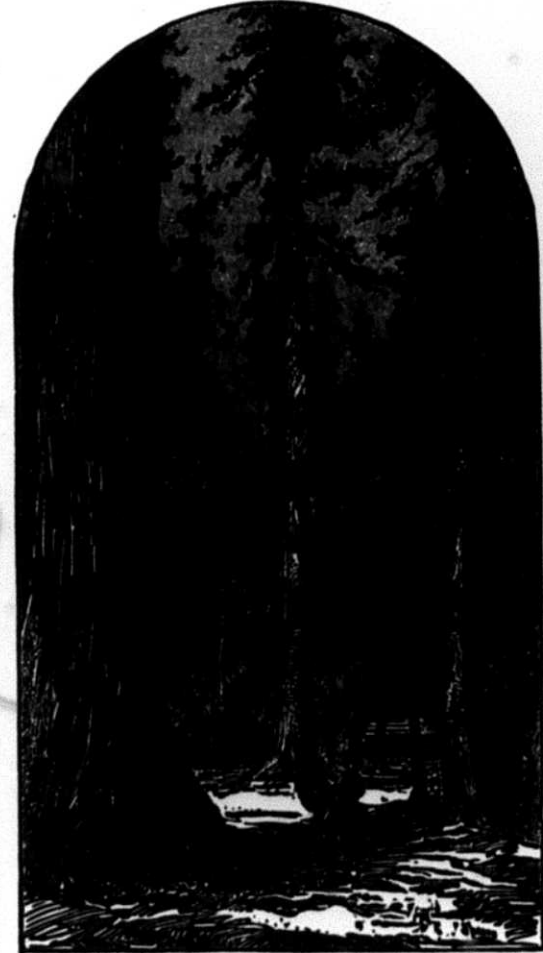
THE BIG TREES.

long into the valley over the towering ledge of the granite wall. "That valley of the Yosemite," says Dr. Talmage, "is eight miles long, a half mile wide and three thousand feet deep. It seems as if it had been the meaning of Omnipotence to crowd into as small a space as possible some of the most stupendous scenery of the world. Some of the cliffs you do not stop to measure by feet, for they are literally a mile high. Steep, so that foot of man or beast never scaled them, they stand in everlasting defiance. If Jehovah has a throne on earth, these are its white pillars. Standing down in the immense chasm of this valley, you look up and wonder at Cæder are Yosemite Falls, dropping two thousand six hundred and thirty-four feet—sixteen times greater descent than that of Niagara. These waters are dashed to death on the rocks, so that the white spirit of the slain waters, ascending in a robe of mist, seeks heaven. Yonder are Nevada Falls, plunging seven hundred feet, the water in arrows, the water in rockets, the water in pearls, the water in amethysts, the water in diamonds. That cascade flings down the rocks enough jewels to array all the earth in beauty; and rushes on until it drops into a very hell of waters, the smoke of their torment ascending forever and ever."