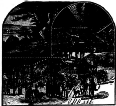
SCENES AT MONTEREY.

One of the most interesting of the attractions hereabout is the famous Eighteen-mile Drive, a splendid macadamized highway, starting from the Hotel del Monte,